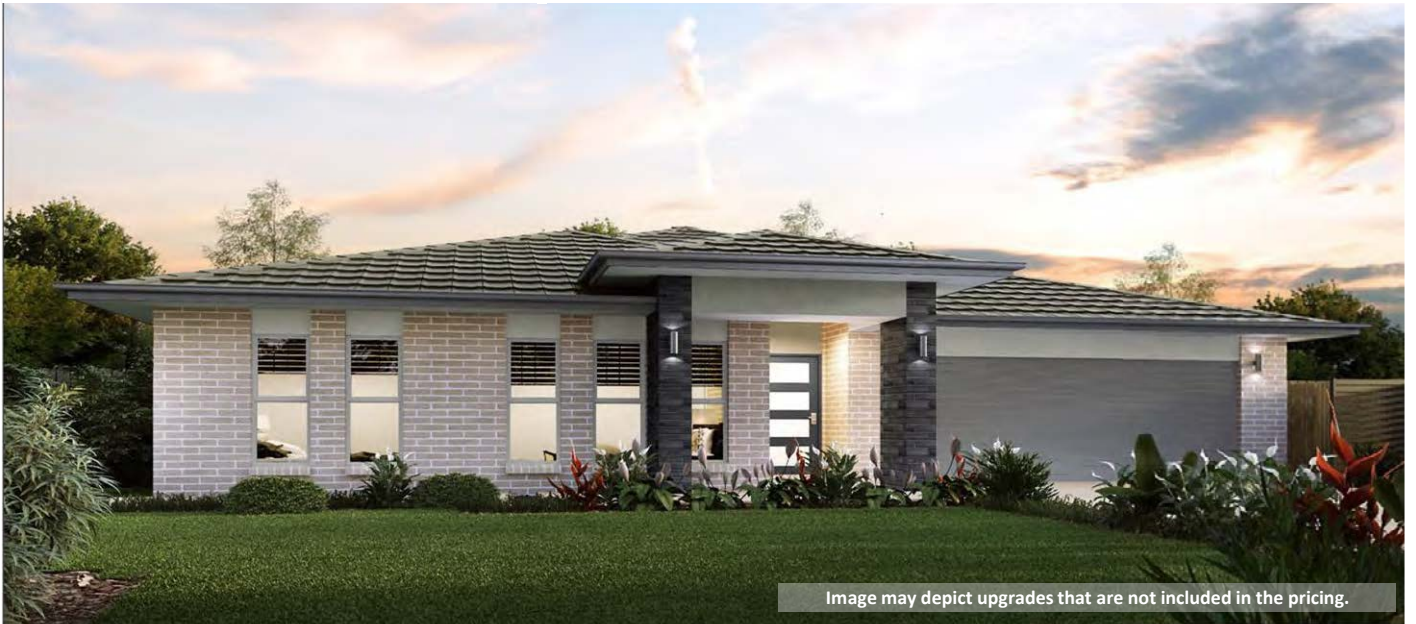
Image may depict upgrades that are not included in the pricing.