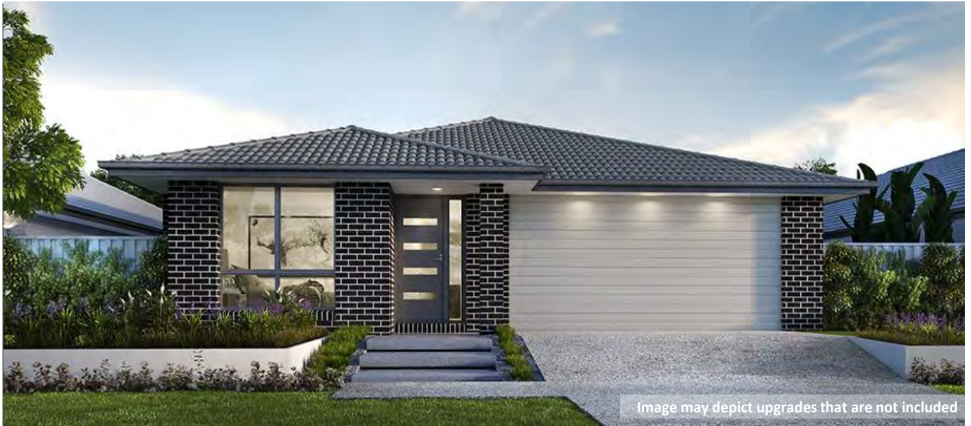
Image may depict upgrades that are not included

Floor area: 179.11m 2 / 19.28sq | Block Size: 646m 2 Address: Lot 110 Bushel Street, Cookes Hill Estate, Armidale