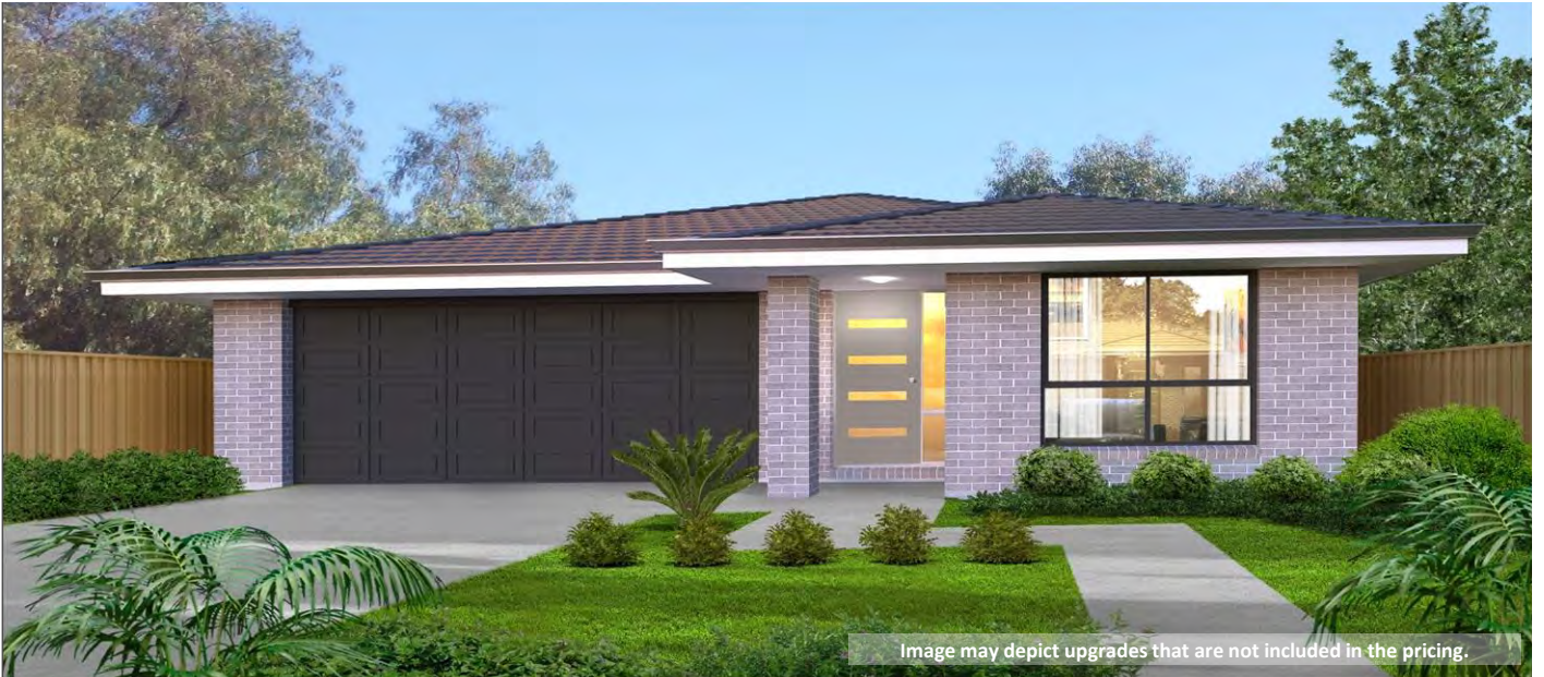
Image may depict upgrades that are not included in the pricing.

Floor area: 196.25m 2 / 21.12sq | Block Size:660m 2 Address: Lot 103 Cookes Road, Cookes Hill Estate, Armidale