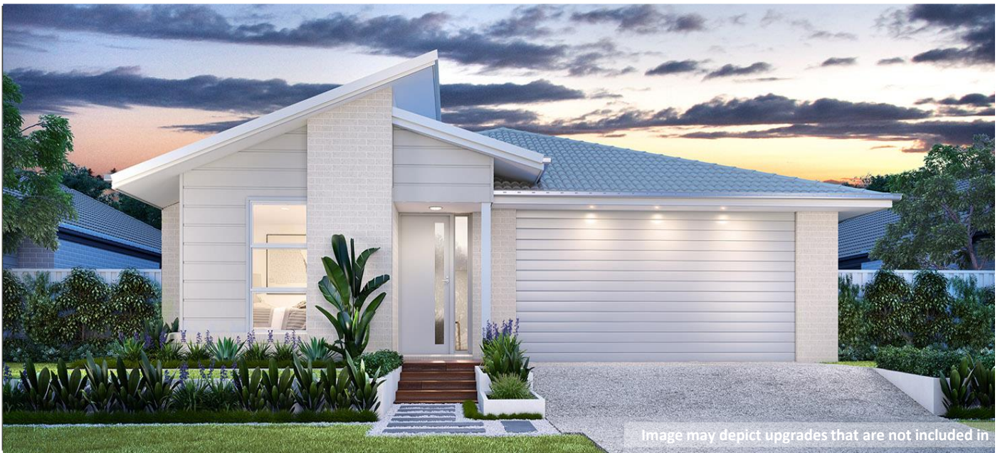
Image may depict upgrades that are not included in

Floor area: 222.32m 2 / 23.93sq | Block Size: 887m 2 Address: Lot 611 Honeysuckle Drive, Armidale